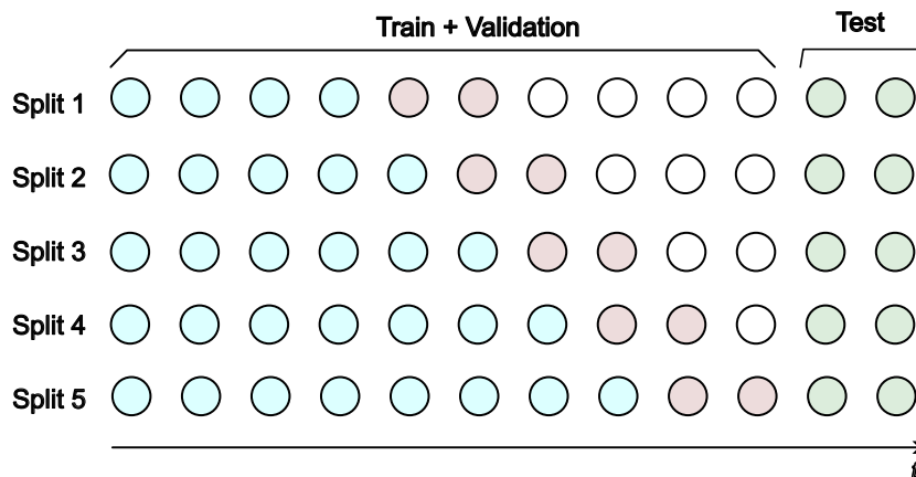
Figure 3: Walk Forward Cross Validation (5 folds)

Walk-Forward cross-validation, also known as time-series cross-validation, is designed specifically for time-series data, where the temporal order of observations must be preserved. In this method, the training set starts with a small subset of data and grows sequentially as more data becomes available. After each training iteration, the model is validated using the next time period. This iterative process mimics real-world nowcasting, where models are trained on past data to predict future outcomes. However, walk-forward cross-validation is less efficient in terms of data usage, as each iteration uses only a portion of the dataset for training and another portion for validation. This can lead to higher variance in performance estimates, particularly in early iterations when the training set is smaller.